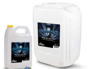
Ultratec Special Effects Luminous 7 Haze Fluid

This fluid was specifically designed to be used in our Radiance Haze Machine. This water-based fluid creates an evenly dispersed haze that is dry and long lasting without leaving any residue. It produces a premium quality, beautiful haze that illuminates the light and laser beams from ceiling to the floor. Luminous 7 Haze Fluid has a high concentration of an active ingredient that allows for low fluid consumption and is completely safe.